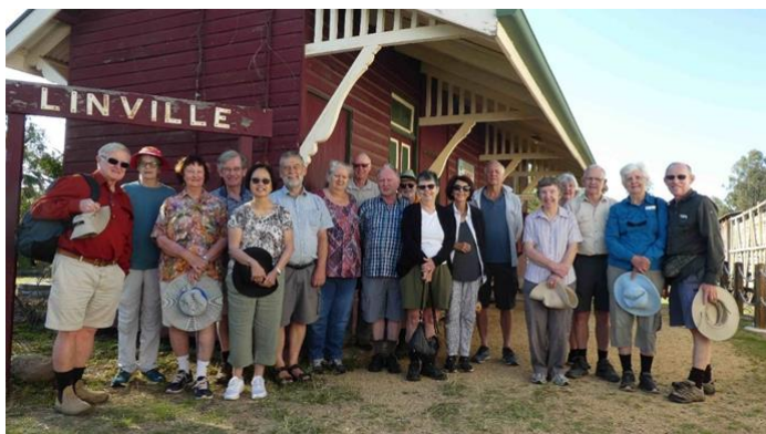
RGSQ group at the former Linville Railway Station (operated 1910 to 1993)

This self-drive two-day trip explored the Upper Brisbane and Stanley River Valleys from Wivenhoe Dam to the East Branch of the Brisbane River and to Mary Cairncross Park overlooking the Stanley River catchment. The trip itinerary focussed on themes reflecting the physical and human geography of the UBV. Speakers from SEQwater and Somerset Regional Council gave overviews on topics of a geographical nature, particularly water management, geology and agricultural activities.