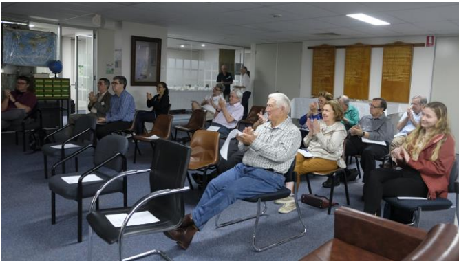
Members attending the 2021 AGM on premises