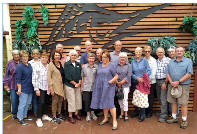
RGSQ group; visit to Boonah and Mt French

Third time lucky! After two postponed days for this trip due to bushfires in the Scenic Rim and then Covid -19 the trip went ahead.