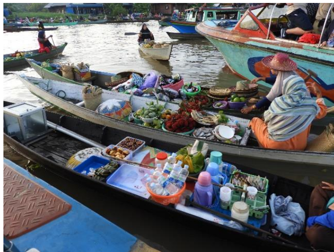
Floating market, Banjarmasin (Ken Granger)

Each area visited seemed to have its own distinctive form of fabric making or decoration. Some, such as batik , were quite familiar, while others such as the ikat woven cloth of Flores were new to us. The process of creating ikat is quite complex beginning with the spinning of the locally grown cotton, establishing the design, the making of the vegetable dyes and then the weaving on back-strap looms. The whole process was demonstrated to us in a village in the hills behind Maumere. It was great to see that these traditions are being maintained and valued.