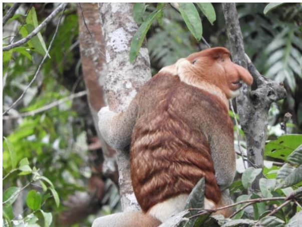
Kalimantan Proboscis Monkey (Ken Granger)

On our way back downstream, we also encountered a large troupe of Proboscis Monkeys in the forest by the river. These monkeys are incredibly agile as they travel through the canopy of the rainforest using their long tails for balance. The crocodiles in the river seem to set up camp below the monkey's roosting trees in the event that a youngster falls.