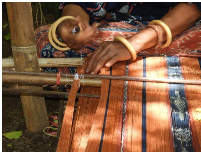
Weaving ikat fabric, Flores

"This cruise was a geographer's delight with a feast of wonderful landscapes, cultures and nature. The discount offered to RGSQ members by Coral Expeditions made it even better."