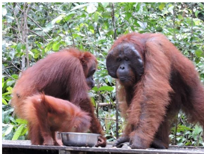
Orangutan family Kalimantan (Judy Granger)

The major wildlife experience came in Central Kalimantan with a cruise by local river boats along the Sekonya River to the Tanjung Putting National Park. The Pondok Tanggui rehabilitation centre in the park maintains a feeding station to supplement the food for Orangutans that have returned to the wild and it was at the feeding station that we had our closest encounters with these magnificent apes. The first to emerge was a family of a mature male with his distinctive cheek flaps, female and youngster.